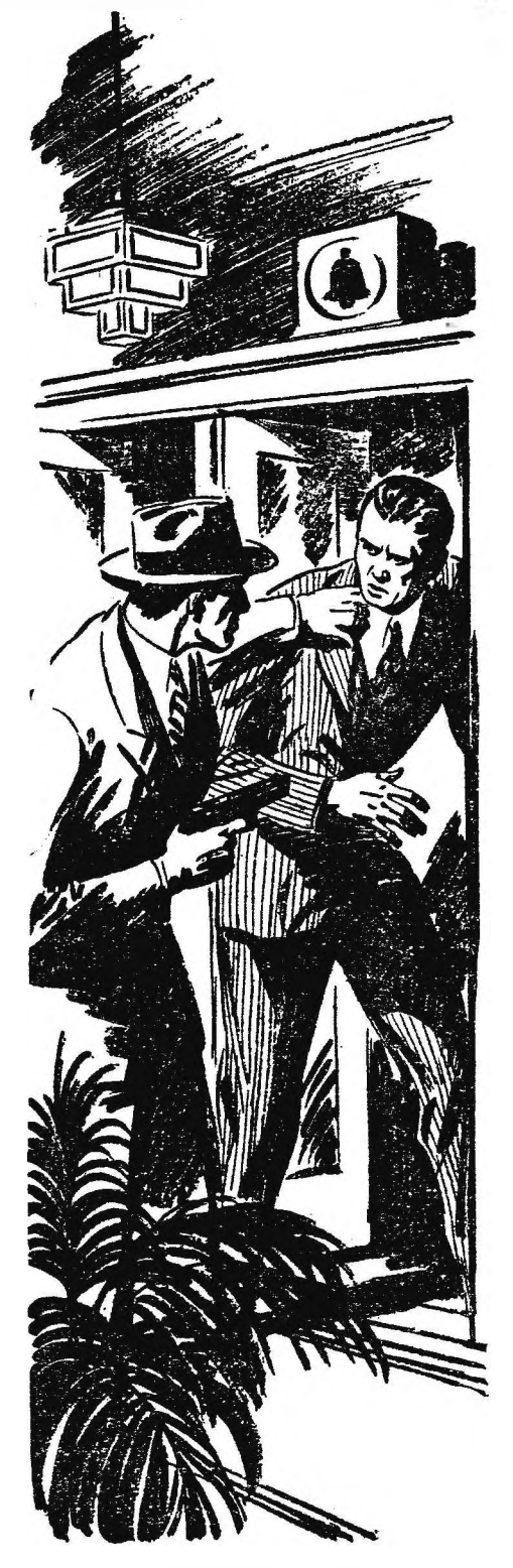
Swiftly the Phantom grabbed Burke by the collar and eased him out of the booth (CHAPTER XIV)

DESPITE the unsatisfactory talk the Phantom had had with the editor of the Sonajo Bugle, he had gained two slight leads. One was that Clyde Caldwell had formerly been employed by the powerful