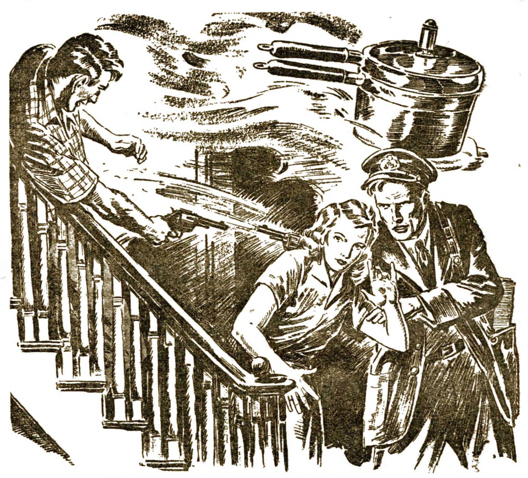
A hard-faced thug, in a loud sport shirt, jumped into view, his gun flaming