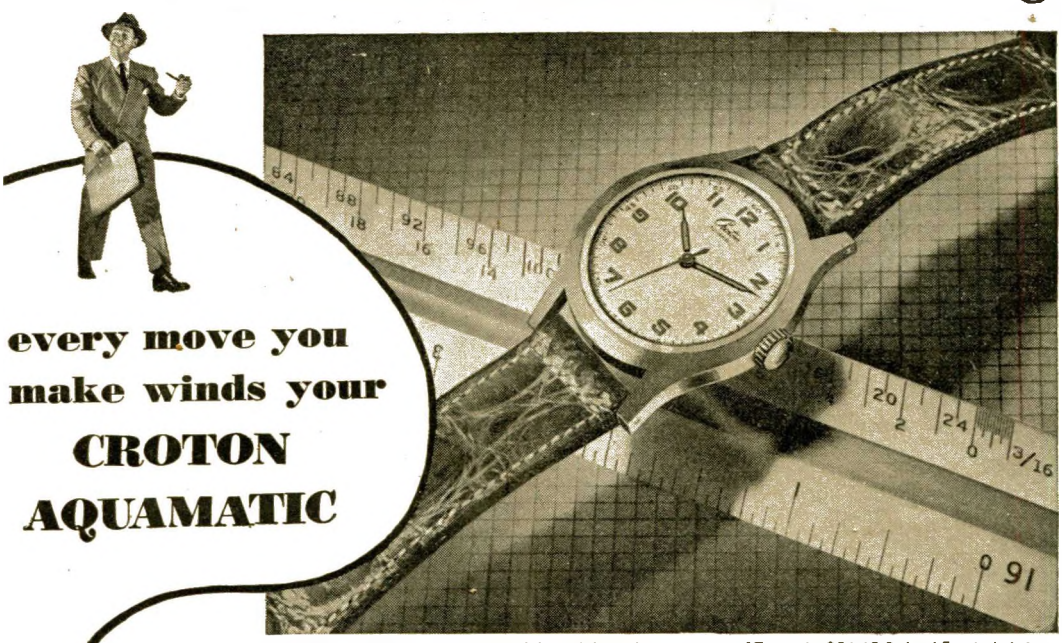
Self-Winding Sweep Second Model in solid stainless steel case. 17 Jewels, $54.45 Federal Tax Included.

You never have to wind your CROTON AQUAMATIC because whatever you do winds it for you! Turn the pages of your magazine . . . take a stroll through the woods — each natural wrist movement